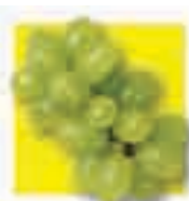
1 handful of grapes