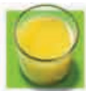
1 medium glass of orange juice