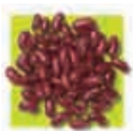
3 heaped tablespoons of cooked kidney beans