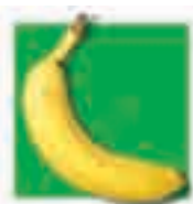
1 medium banana