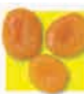
3 whole dried apricots