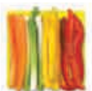
A handful of sliced peppers, onions and carrots