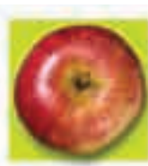
1 medium apple