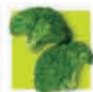
2 spears of broccoli