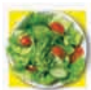
1 small mixed salad