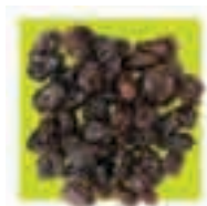
1 tablespoon raisins