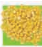
3 heaped tablespoons of corn