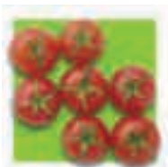
7 cherry tomatoes