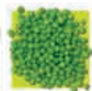
3 heaped tablespoons of peas